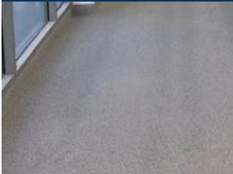
Stonclad UT light texture was installed to provide the required slip-resistance

THE STONHARD DIFFERENCE Stonhard is the unprecedented world leader in manufacturing and installing high-performance polymer floor, wall and lining systems. Stonhard maintains 300 Territory Managers and 175 application crews worldwide who will work with you on design specification, project management, final walk through and service after the sale. Stonhard's single-source warranty covers both products and installation.